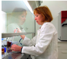
Basic Research / Research Institutes