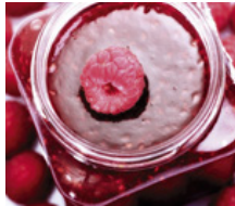
Food / Beverage