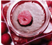
Food / Beverage